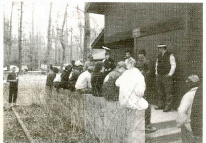
Members of Pamunkey Chapter hold their meeting on Sunday morning during the weekend of the Winter Ordeal.