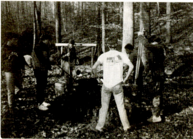
Members of the Lodge Ceremonies Team rebuild the fire ring in preparation for the Ordeal and Brotherhood ceremonies.