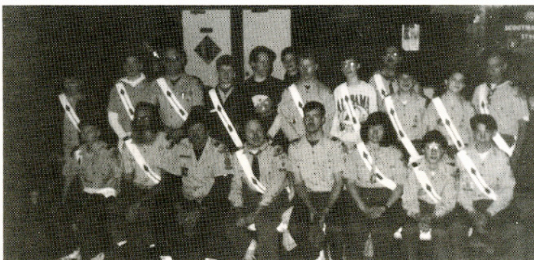
During the Winter 1992 Ordeal, 23 candidate passed the Ordeal to become members of the Order of the Arrow. A complete list of names of these Scouts and Scouters can be found on page 4.

The Winter Ordeal is one of three such events conducted by Kecoughtan Lodge during each year. The next Ordeal is scheduled for June 1992. Watch your mail box for information about that event. That gathering is our traditional time for preparing camp for the summer influx of Scouts. See you there!