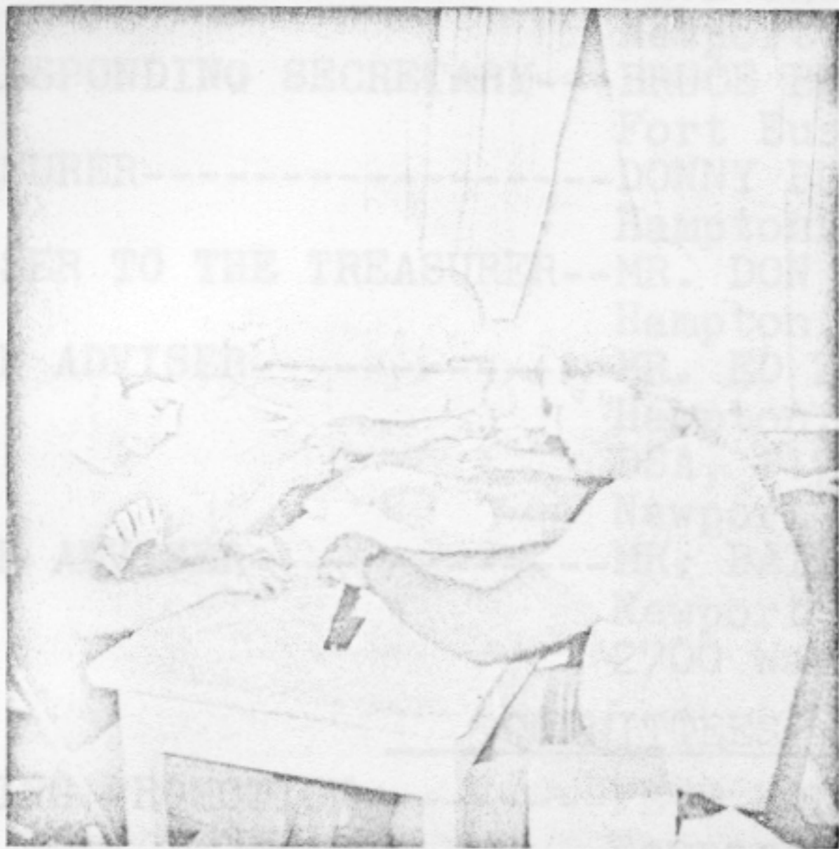
Brothers assemble pamphlets Friday night