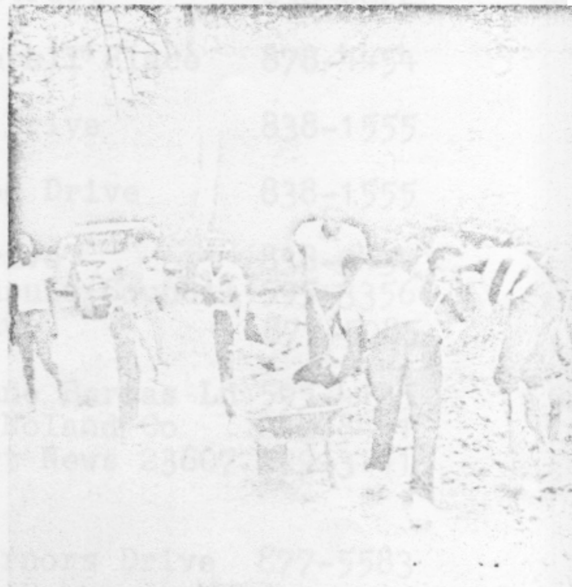
Joyful candidates work at waterfront